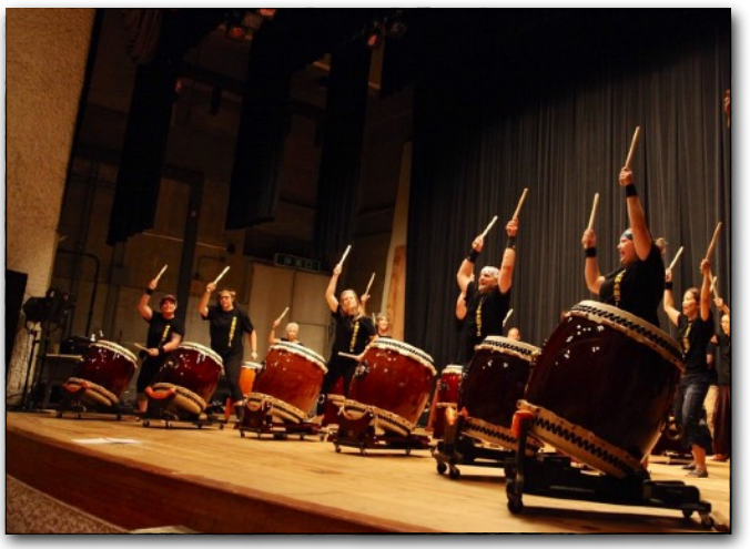
INADANI Taiko Course - Performance day

2019 will see TOKARA going on it's 15th year of international tours throughout the world. That seems like a relatively very young age for a taiko performance group, but so much has happened that it almost seems like 30 years. Truthfully, we could not have had such an eventful 15 years without each and every person who has attended our concerts, workshops and intensives. And we certainly cannot forget all of the people who send kind messages and feedback to us after each event. We hope to continue to grow stronger in the coming years...just taking it day-by-day.