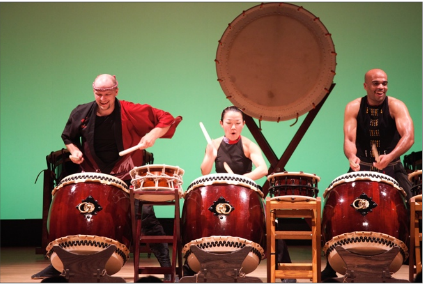
"Tenchi Shinmei" Japan Tour 2010 in Nagoya City

We started moving in the space on December 31st just before the last performance of 2010 to bring in the new year. Then continued moving little by little until our public grand opening celebration on January 15th. Now the office is near to completion, and the work continues at a fast rate with lots of projects currently in the works.