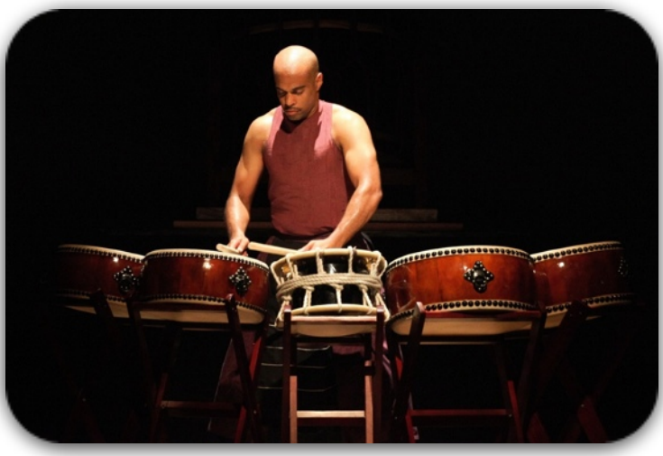
"Jyoraimei" solo at the Iida Cultural Puppet theater

For the members of the group, this office means an uninhibited space which belongs to all of the members. We can all work together, eat together, everything except practice...yes, we still need a dojo, and that is currently the number one goal.