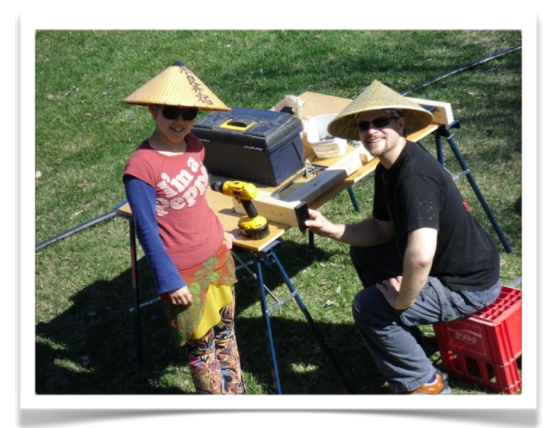
Building new stands for our drums before the start of the North America Tour