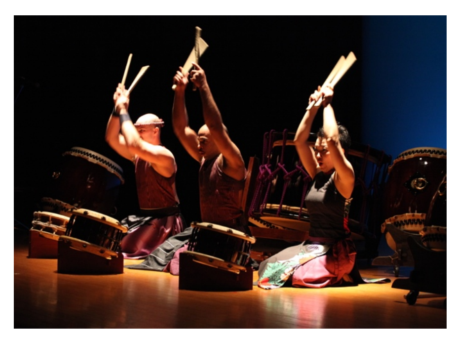
"Tenchi Shinmei" Japan Tour 2011 in Ina City

After the move to the new office, we immediately started on the 2011 tour schedule. First it was off to the United States in April/May where we began