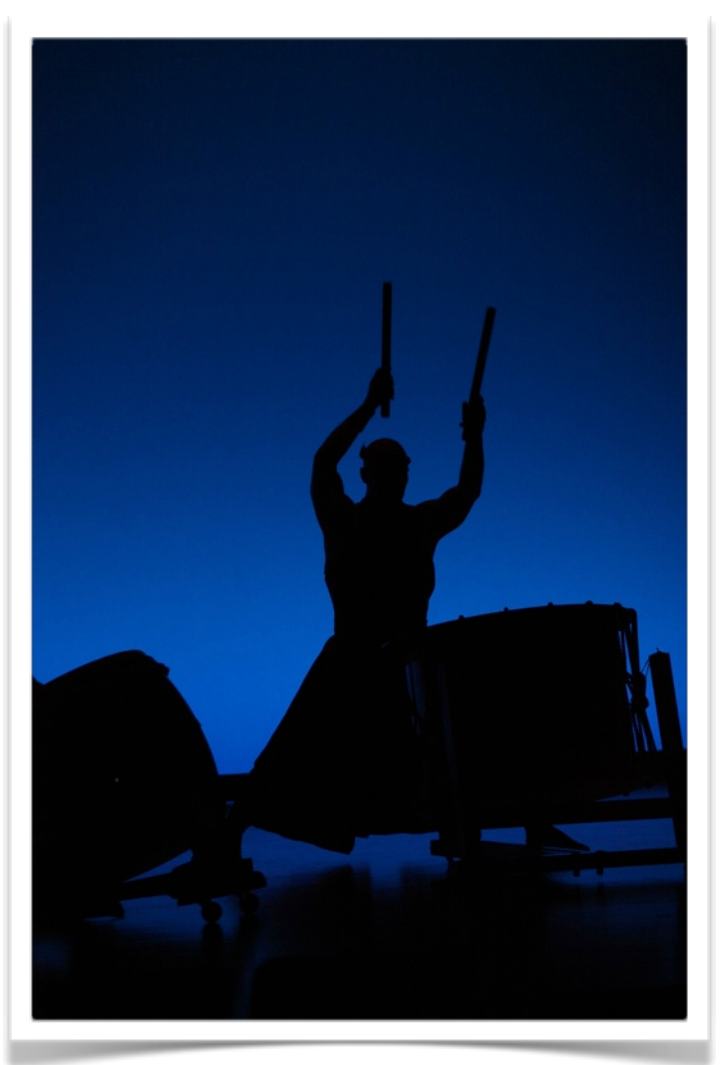
Havixbeck Sillouette - Japan Tour 2011 in Nagoya City

Sadly, the end of the Fringe Festival came and Ensemble Rivelta returned to Japan. So it was time to pack our bags and head for mainland Europe. The schedule was tight, thanks mainly to traffic on the M1 to London, yet we managed to store the drums, and race off to Leuven in Belgium to host two weeks of Tokara's Wadaiko Bootcamp.