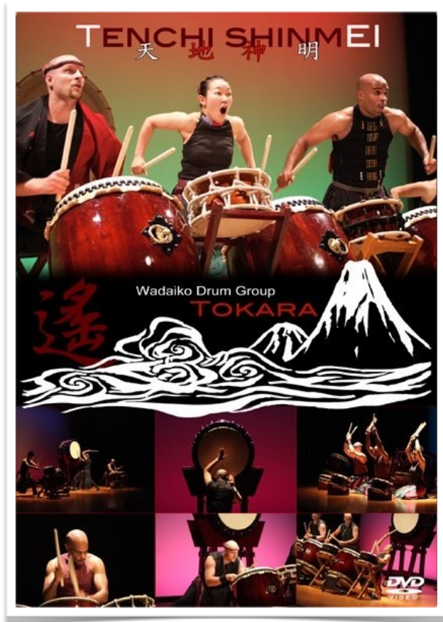
Tokara DVD Jacket

While preparing to film these DVDs, we decided to try something new. We opened the project for donations on Kickstarter in the hopes that we could raise enough funds for production. We set a target of $8,500 to fund the project, but we were not able to reach our target so the money raised was automatically refunded by the Kickstarter website. However, we opened the same fundraising project on a new website: http://www.indiegogo.com/Tokaras-First-DVD-Ever We had the same target amount, although on this site, we were allowed to keep whatever funds we did raise, even if we weren't able to reach our goal. The project on this site expired as of May 1st, and we are happy to announce that we raised over $900.00. Our sincerest thanks go out to all of those who have made donations and who have helped spread the word about this project.