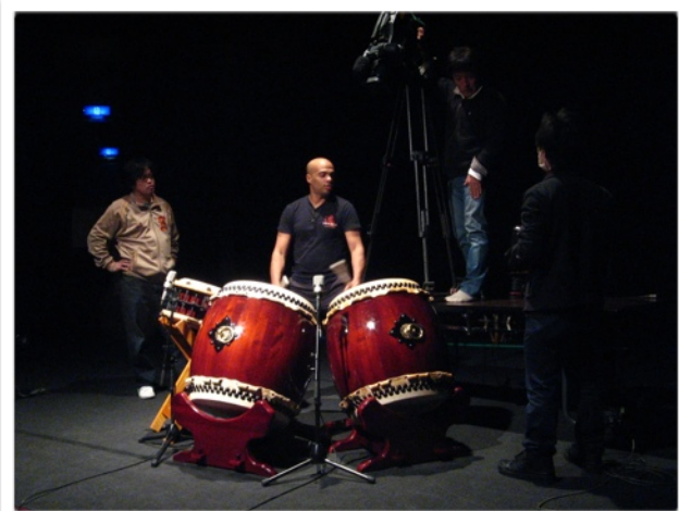
Art preparing for Stairmaster shoot