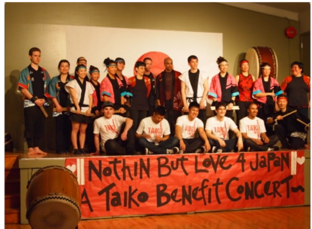
Benefit concert, Vancouver, Canada