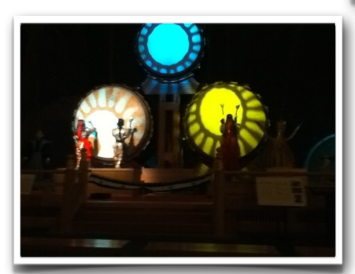
World's largest Odaiko, Takayama

groups for Nihon no Wadaiko Hibiki En, a concert produced by Dosshin. The other guest group in this show was Ryukyu Koku Matsuri Daiko who traveled all the way from Okinawa to perform. We had a great time, and even had a moment to take a quick tour of Matsuri no Mori a museum near the theater that hosts the world largest Odaiko, measuring three hundred eighteen centimeters!