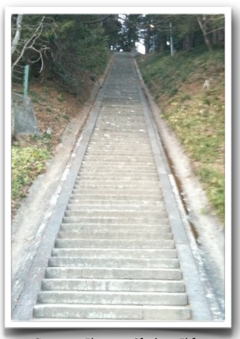
Steps at Iinuma Shrine, Iida