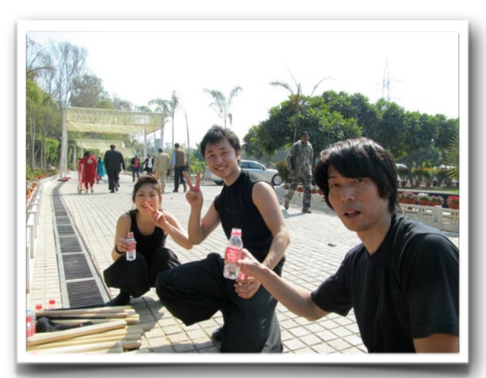
A short rest between performances