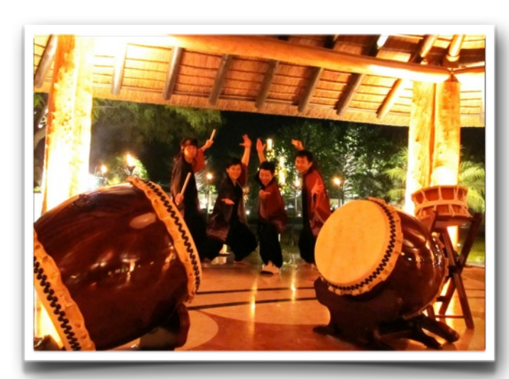
Tokara in Delhi, India

Hello again, and welcome to another installment of the Wadaiko Tokara