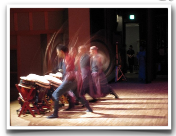
Tokara performing "Hatou no Hibiki" in Nagoya

groups for Nihon no Wadaiko Hibiki En, a concert produced by Dosshin. The other guest group in this show was Ryukyu Koku Matsuri Daiko who traveled all the way from Okinawa to perform. We had a great time, and even had a moment to take a quick tour of Matsuri no Mori a museum near the theater that hosts the world largest Odaiko, measuring three hundred eighteen centimeters!