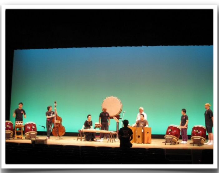
Ensemble Liberta Rehearsal