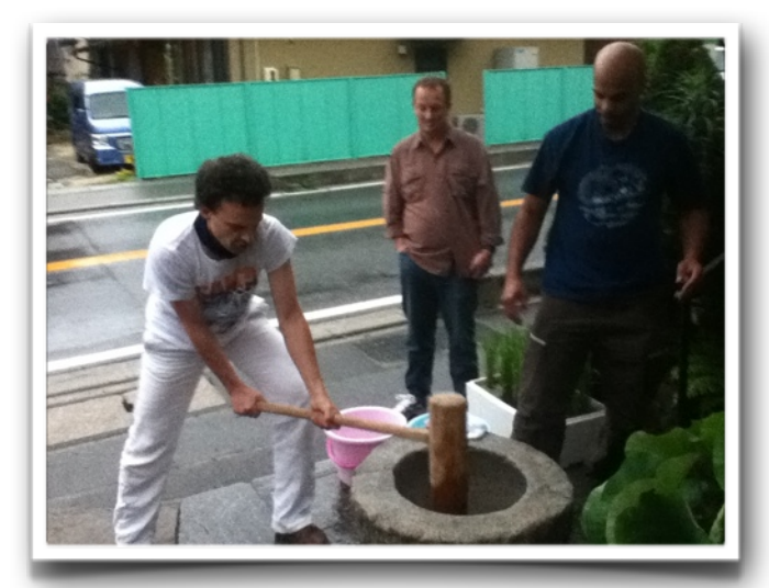
Making mochi (ricecake) for dinner